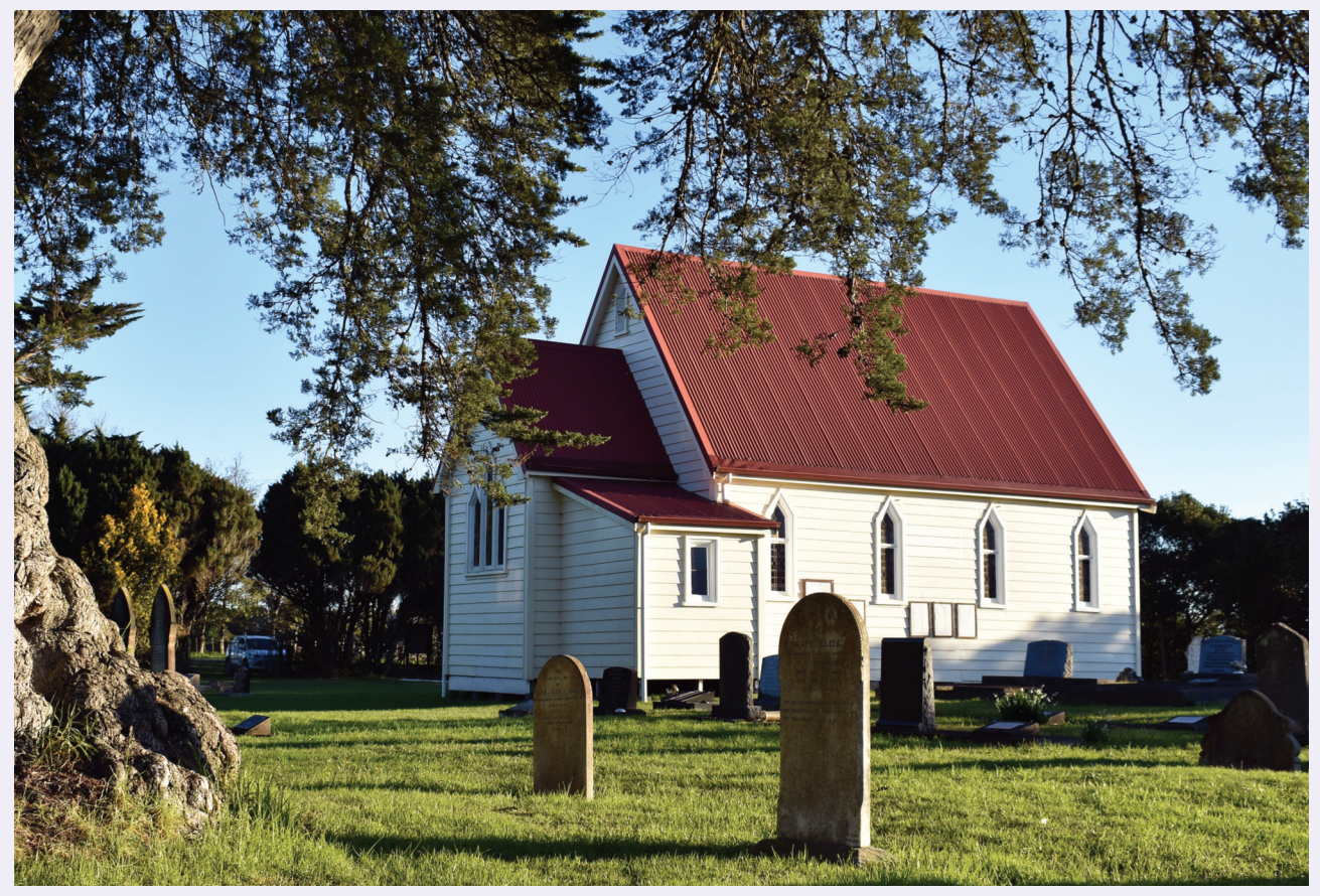
St. Michaels and All Angels Church - Hakaru

Given St Michael's and All Angels idyllic setting, it is a popular place for weddings. Burials and interment of ashes still take place.