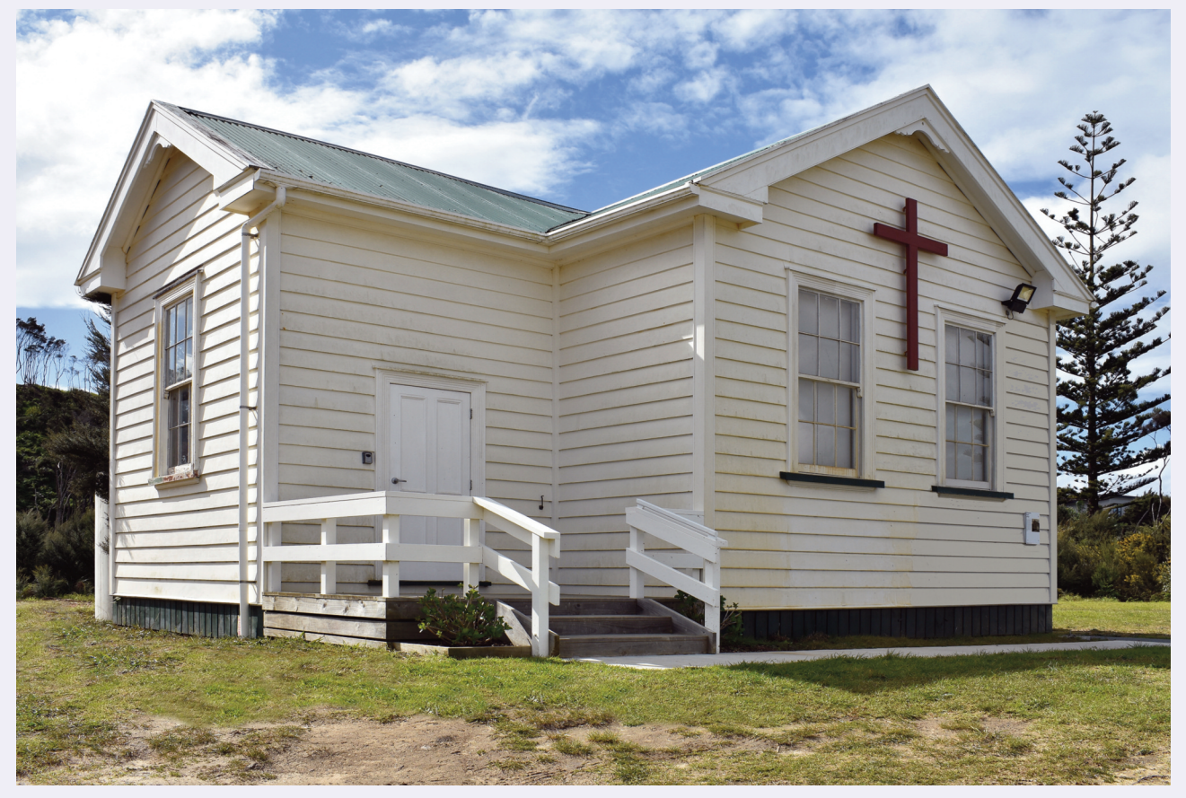
The old church now a theatre in Mangawhai Historical Village

Gospel-learning the art of continuous conversation-becoming a "contagious church."