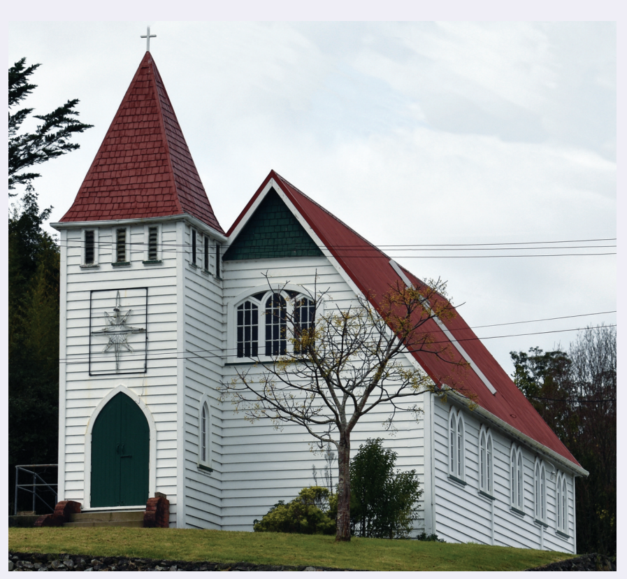
St. Paul's - Kaiwaka

The church was built in the 1930s and extended in 1962. It is situated in the centre of Kaiwaka village next to the primary school. Seating 60 -80. there is also a hall with toilets and a kitchen adjacent. Services are offered on the first and third Sundays of each month, with approximately half of our members also worshipping at Mangawhai on the other Sundays. The population of Kaiwaka is growing and so (we pray) will the church. Already half of our group are long-term locals while the other half have moved to Kaiwaka within the last twelve or so years.